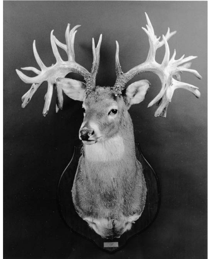
Taxidermy mount of the world record-holding atypical buck found near the confluence of the Mississippi and Missouri Rivers in 1982.

We hope your interest in Missouri's natural history will flower through use of this collection!