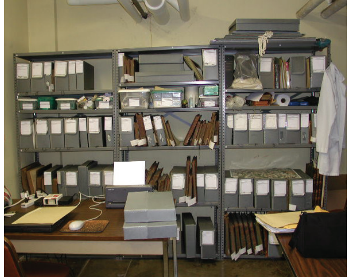
Former Callaway County Local Records project site. No date.

No Date . Found loose document. The text refers to a "Nelson" and a "Lauderback" working the gold fields and leaving their families in destitute circumstances. Although not dated, the blue paper likely indicates it is from the 1850s and is referencing the California Gold Rush. (Editorial Note: Finding a stray document is typically frustrating for an archivist, but this example illustrates how they can be interesting, even out of context.)