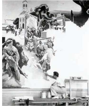
Left: Thomas Hart Benton painting A Social History of Missouri in the Missouri State Capitol House Lounge. No date.