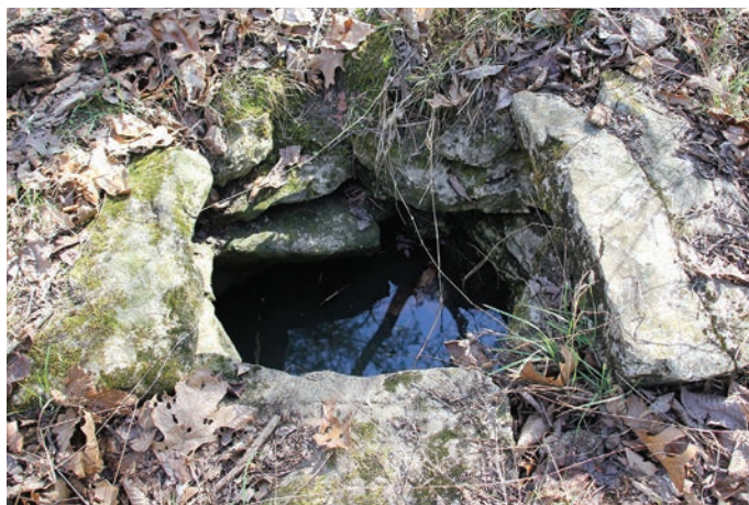
Spring fed well in Mark Twain National Forest. April 2018.

During an investigation of the surrounding area, I found the corner stones of an adjacent structure—possibly a small house—and numerous early area maps show a roadway always running through the vicinity. At one point, the owners split away a 15-acre wedge that included the well but no tillable ground. The soil is so poor that the 1880 Agricultural Census even shows a neighbor with several 40-acre tracts earning almost his entire income from just two acres of tobacco. The well