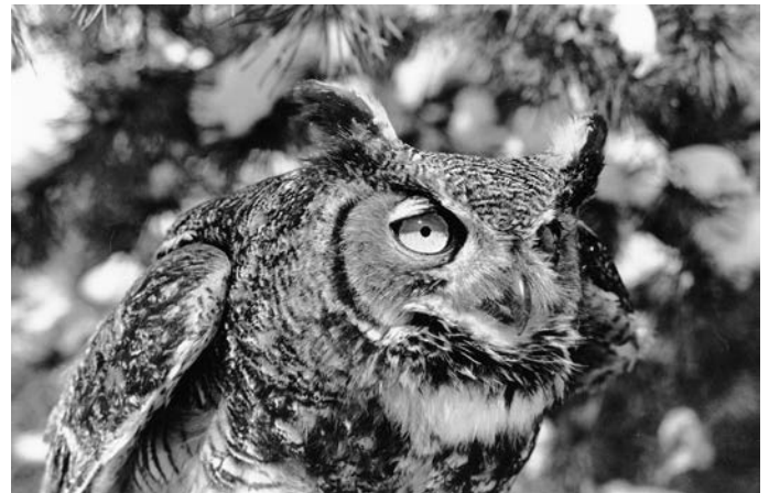
An adult great horned owl about to take flight from a snowy tree. February 1985.