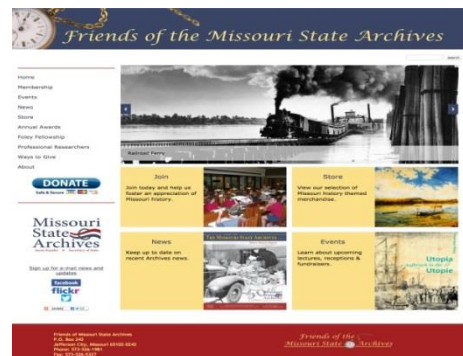
Redesigned Friends of the Missouri State Archives Website

Last but definitely not least, the Friends unveiled their redesigned website in September 2015 ( www.friendsofmsa.org ). Along with viewing a calendar of upcoming events, past editions of the newsletter and organizational information, visitors can now renew their membership, make a donation and/or purchase select Missouri-themed items through an online store.